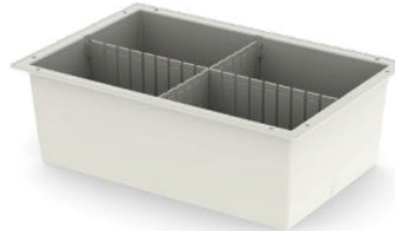
20cm TRAY - MMT204060

SHORT DIVIDER - MMD1040 LONG DIVIDER - MMD1060