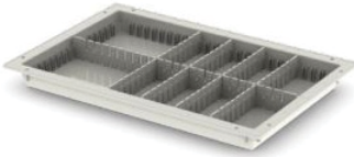
5cm TRAY - MMT054060

SHORT DIVIDER - MMDO540 LONG DIVIDER - MMDO560