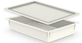
10cm TRAY - MMT104060ND

SHORT DIVIDER - MMD2040 LONG DIVIDER - MMD2060