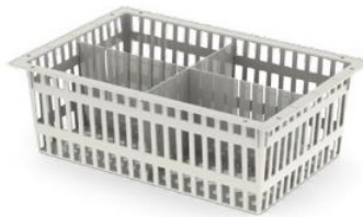
20cm BASKET - MMB204060

SHORT DIVIDER - MMD1040 LONG DIVIDER - MMD1060