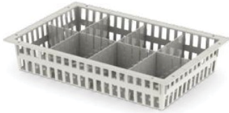
10cm BASKET - MMB104060

SHORT DIVIDER - MMD1040 LONG DIVIDER - MMD1060