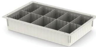
10cm TRAY - MMT104060

SHORT DIVIDER - MMDO540 LONG DIVIDER - MMDO560